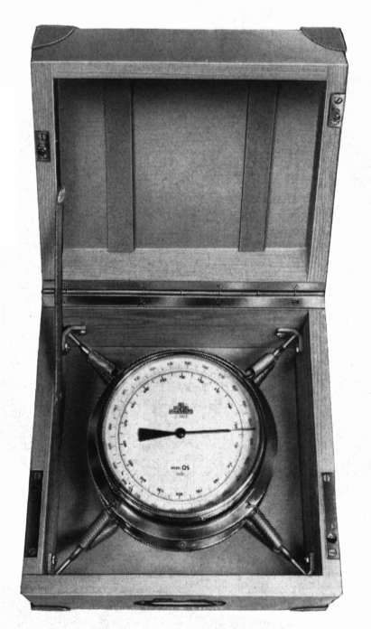
Fig. 1 Station aneroid 15ps in transportcase 15h