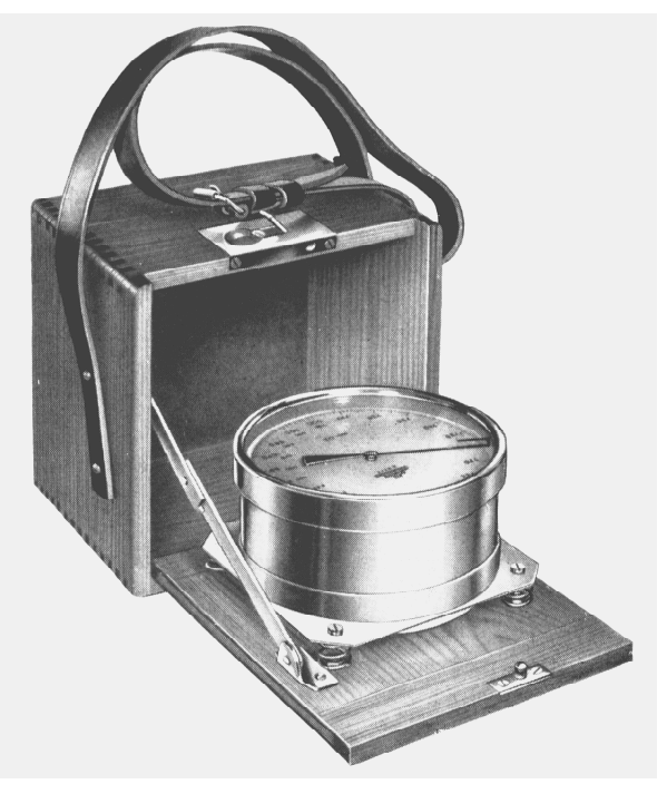
Fig. 4 Mine aneroid barometer 15pg in everready case

Mine aneroid barometer 15pg is arranged in a springy kind of way on the cover of an everready case as per fig. 3, which is carried on a strap, in front of the chest.