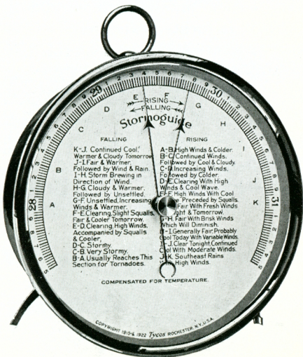
No. 2256X (About one-half actual size)

Be Weather-wise. Own a Tycos "Stormoguide."