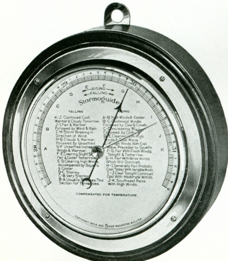
No. 2551 (About one-third actual size)